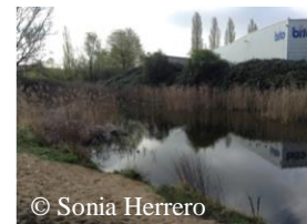
Pond with poor water quality in a residential area in Berlin, used for swimming.

The second important goal of this initiative is to create an international collaborative network for young and early career scientists in Europe. This project provides an excellent chance to actively participate in an interdisciplinary project and to meet other young researchers!