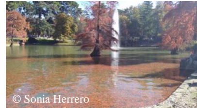
© Sonia Herrero Pond in a city park (Retiro) Madrid (Spain) with increased allochthonous matter input.

Urban algae was selected the 2nd Collaborative European Freshwater Science Project for Young Researchers ("FreshProject"), a joint initiative by the European Federation of Freshwater Sciences (EFFS) board, the European Fresh and Young Researchers (EFYR) and the representatives of the Fresh Blood for Fresh Water (FBFW) meetings.