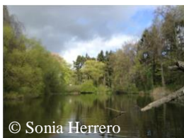
Pond in city park for recreation in Berlin (Germany).